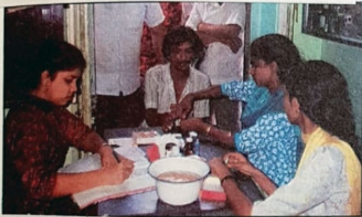
Blood Group Project in progress on 23/9/90