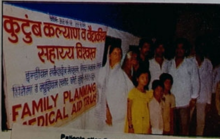
Patients attending camp on 23/9/90