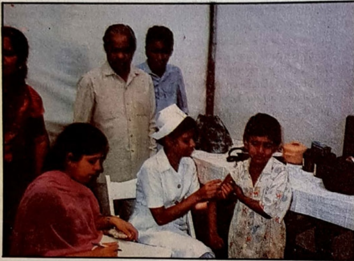
Immunisation on 15 / 04 / 90