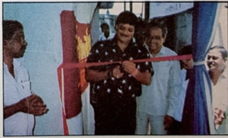
Inauguration of the camp dated 29/4/90 by Mr. Viju Penkar ( Cine Star )