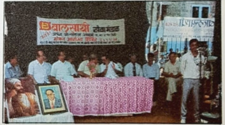
A speech addressed by Chairman of Balsathi Seva Mandal on 6/5/90