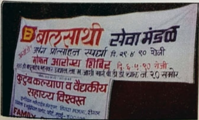
Exposition of F. P. & M. A. Trust Banner on 6/5/90