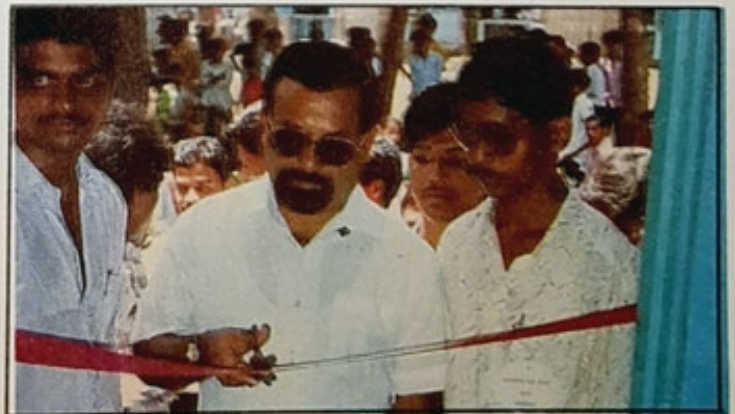
Inauguration of the camp on 6/5/90