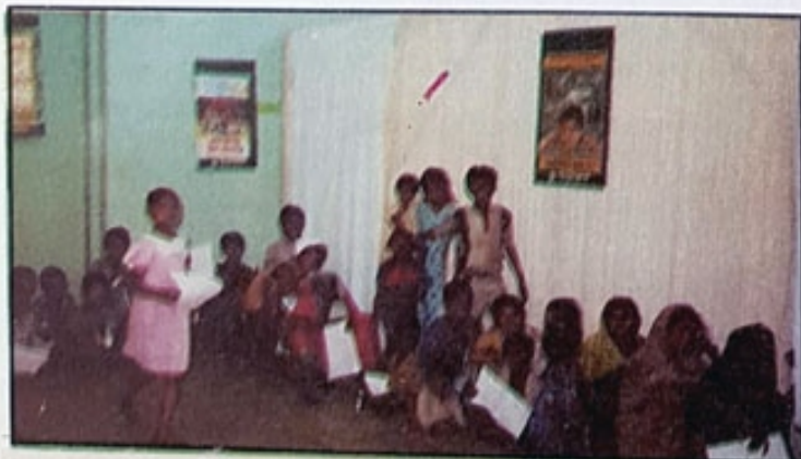
Patients waiting in a queue on 3/2/91