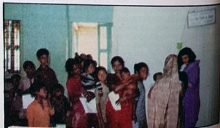
Patients waiting to be examined on 3/2/91