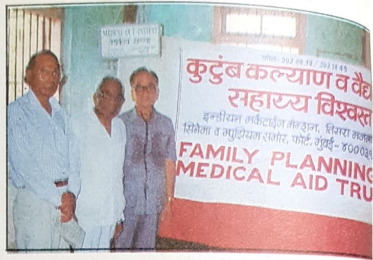
Know Your Blood Project on 27/5/90