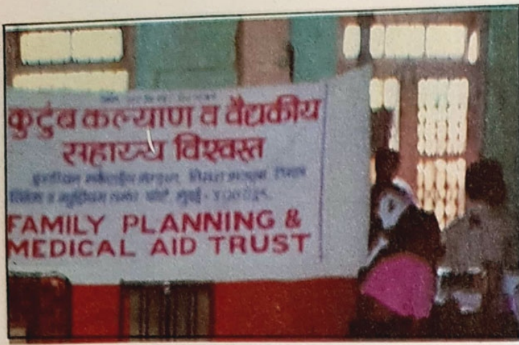
Family Planning Banners exposed on 27/5/90